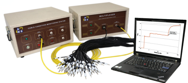
Figure 1. CHAR System with Automated Multiplexing capabilities