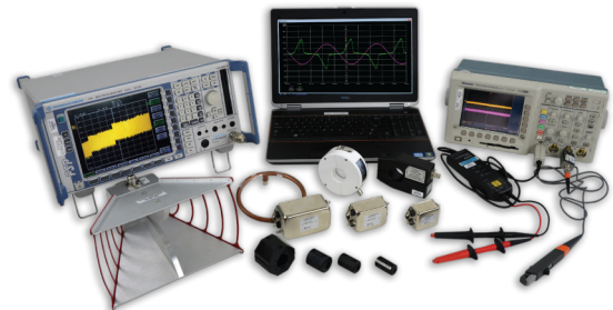
Figure 2. EMI/RFI Test Equipment