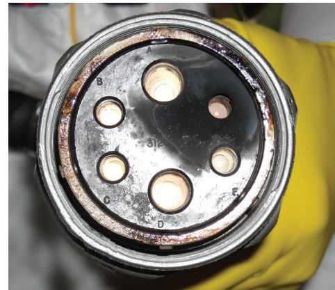
CRDM Connector Following Pin-to-Pin Short